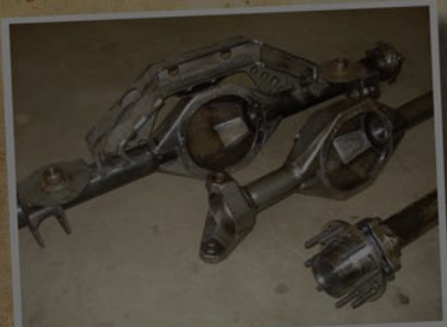
Custom axes built to your specs