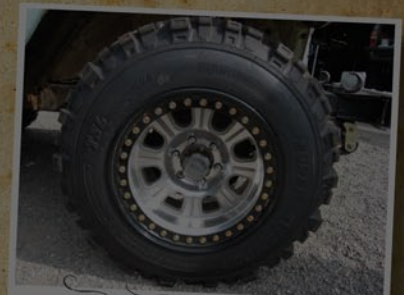
Race Line Beadlocks